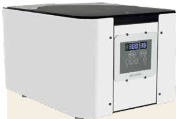
Display indicative only